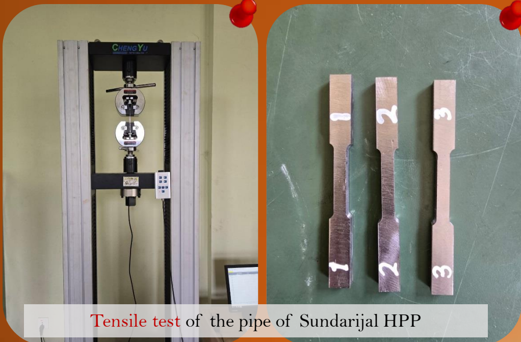
Tensile test of the pipe of Sundarijal HPP

Tensile tests carried out for Penstock pipe at SMRT Lab, DoME, KU for Sundarijal HPP, Nepal as a part of the Condition monitoring of the penstock pipe of Sundarijal HPP project running at TTL