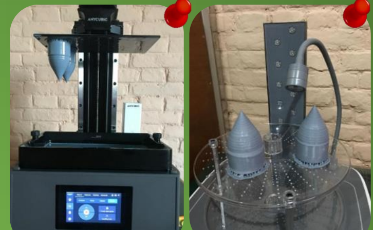
Resin printing of needles at TTL with different erosion levels along with UV curing