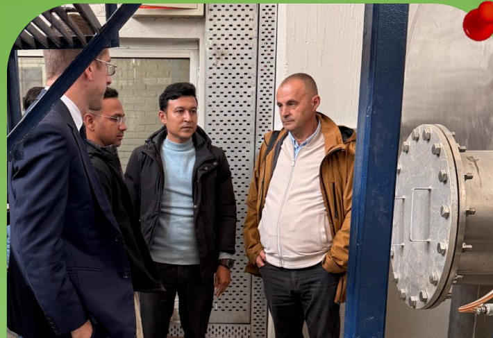
Visit from Ropeway Nepal, Kathmandu Podway and Innovator for prospective collaboration of a hydrokinetic turbine testing at TTL on Dec 22