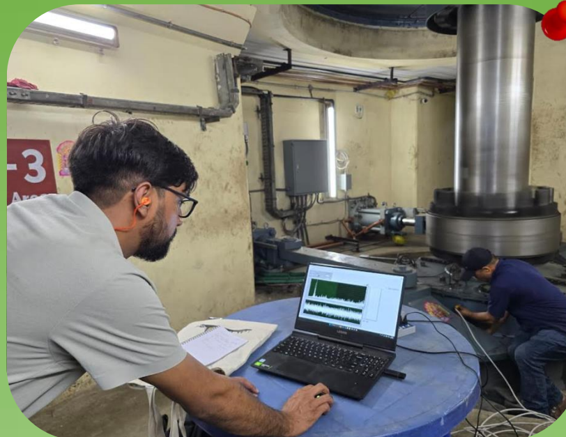
Vibration measurement at Kaligandaki A hydropower plant (144 MW) on September 5-6