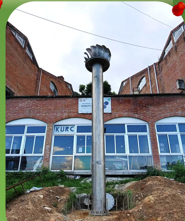
A TTL sculpture with the lab scraps made outside TTL

Date for the conference, CRHT XIV confirmed for March 23, 2025.