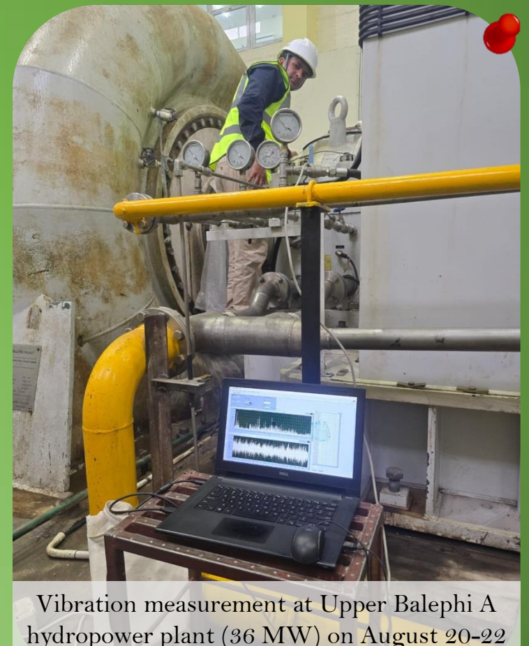
Vibration measurement at Upper Balephi A hydropower plant (36 MW) on August 20-22