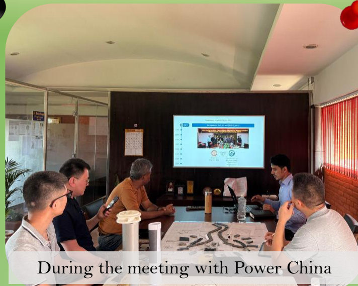
During the meeting with Power China

Meeting with Power China for identifying potential collaborations in hydropower sector through HRCHR on August 24