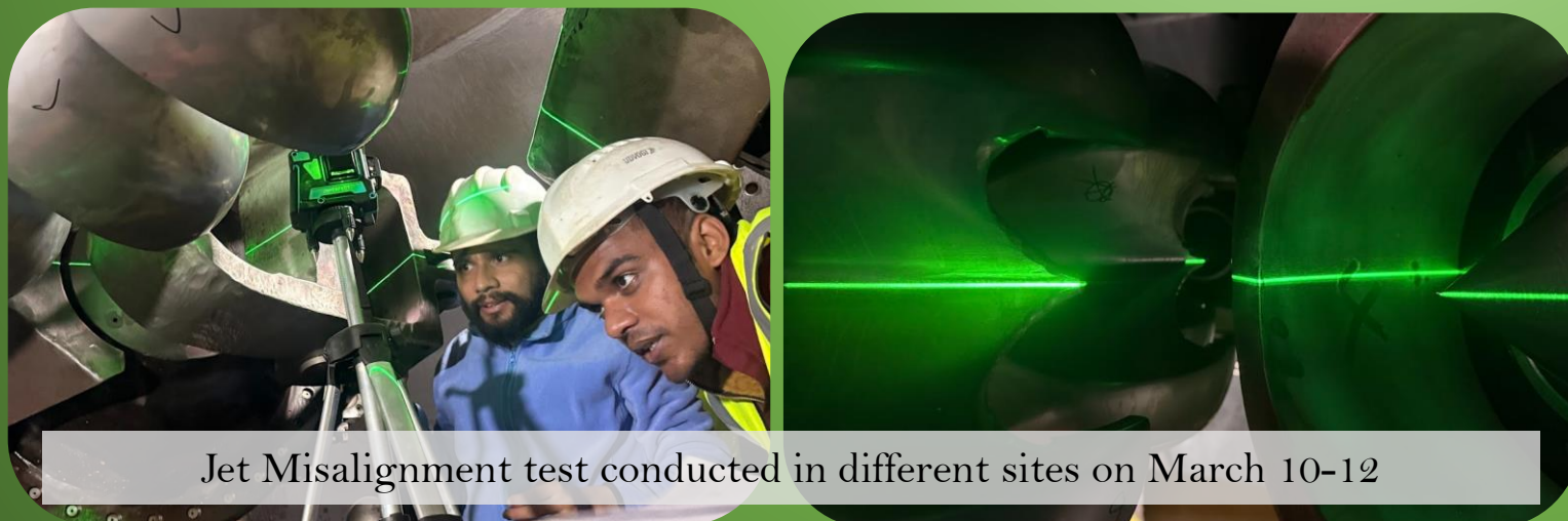
Jet Misalignment test conducted in different sites on March 10-12

Vibrations and jet misalignment tests performed in Ghar Khola and Mistri Khola Hydropower Plants on March 10-12.