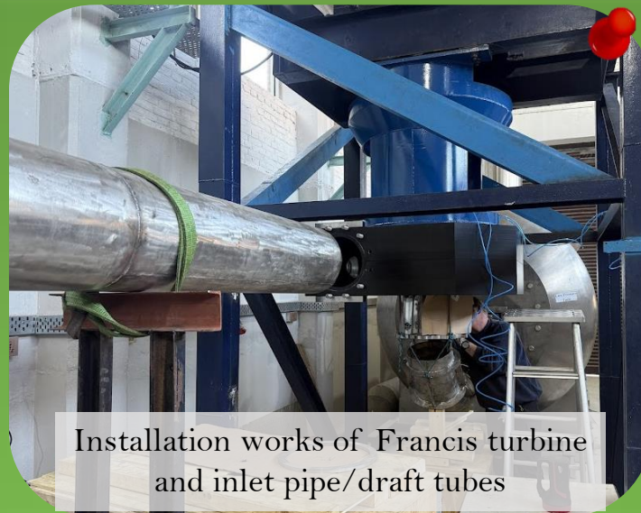
Installation works of Francis turbine and inlet pipe/draft tubes