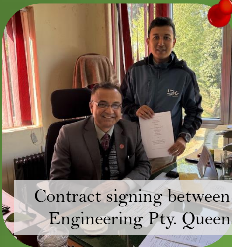
Contract signing between TTL-SoE and Pressure Engineering Pty. Queensland on December 17

A 12 months' contract was signed between Turbine Testing Lab - School of Engineering, KU and Pressure Engineering Pty. Queensland, Australia for conducting various research including the design of Reversible Pump Turbines .