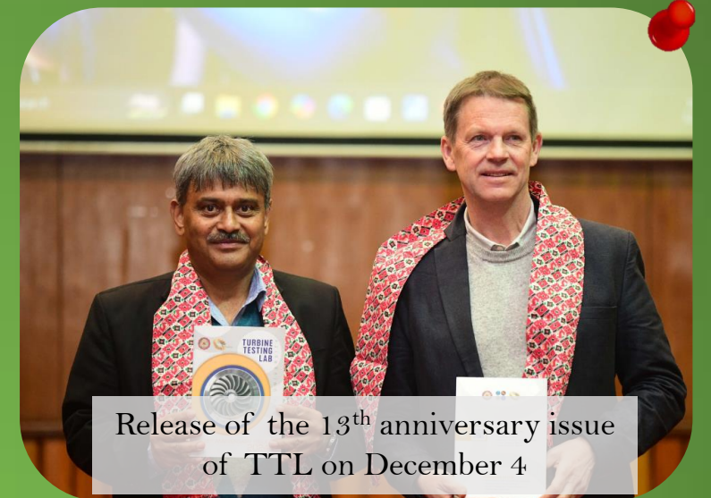
Release of the 13 th anniversary issue of TTL on December 4