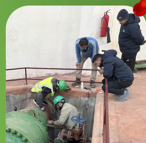
Visit to Upper Mailing HPP by TTL team on December 13-14 for various measurements in the power plant