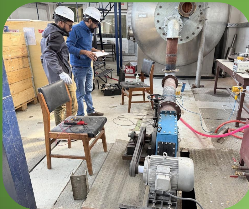
Testing of cross flow turbine at TTL

Preliminary testing of cross flow turbine manufactured by Nepal Yantra Shala Energy was carried out at TTL on November 18-24