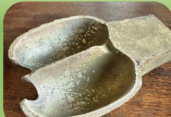
Sand cast Pelton bucket (unfinished) for the new rig setup at TTL at NYSE

Preliminary testing of cross flow turbine manufactured by Nepal Yantra Shala Energy was carried out at TTL on November 18-24