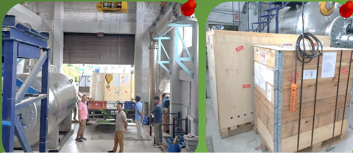
Francis turbine model fabricated in PTM, Norway arrived KU-TTL on August 16. The installation of the turbine is planned for November, 2024 in the presence of manufacturers

Selected papers from CRHT – XII are published in IOP Conference Series: Earth and Environmental Science, Volume 1385. Following is the link of the issue: https://iopscience.iop.org/issue/1755-1315/1385/1