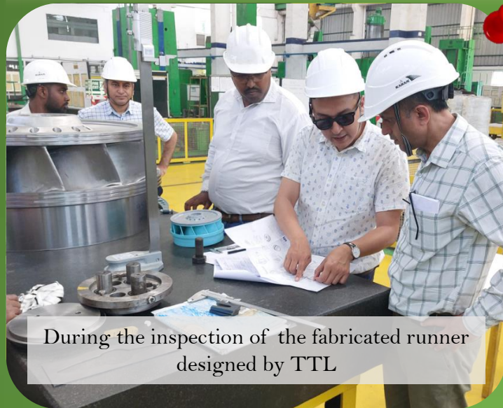
During the inspection of the fabricated runner designed by TTL

Francis runner designed by TTL for Molung Hydropower plant for minimizing sediment erosion fabricated in India. Inspection of the fabricated runner was carried out on April 21-24 in Bangalore.