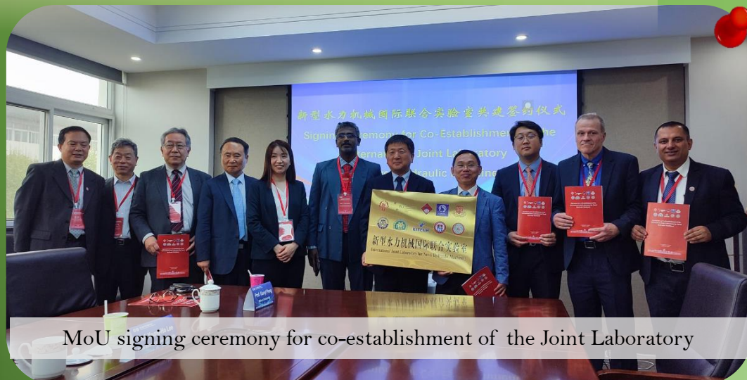
MoU signing ceremony for co-establishment of the Joint Laboratory

MoU signed for co-establishment of the International Joint Laboratory for Novel Hydraulic Machinery between ten universities.