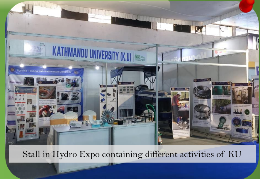
Stall in Hydro Expo containing different activities of KU

MoU signed for co-establishment of the International Joint Laboratory for Novel Hydraulic Machinery between ten universities.