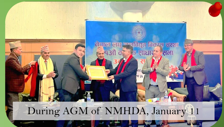
During AGM of NMHDA, January 11

48 abstracts received for CRHT-XII conference going to be held on March 18, 2024.