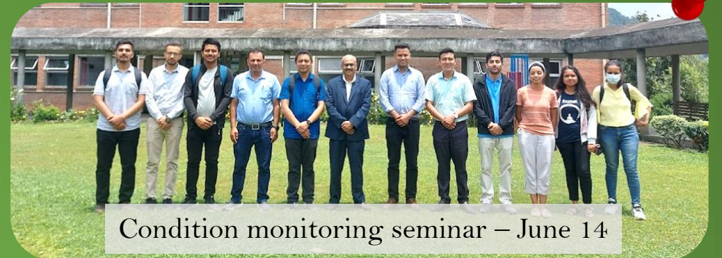
Condition monitoring seminar – June 14

Training conducted by TTL for 8 days (June 6 -14) in cooperation with TTC and Nepal Hydropower Academy (NHA) in the topics of: