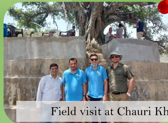
Field visit at Chauri Khola by NTIC and TTL team on June 8