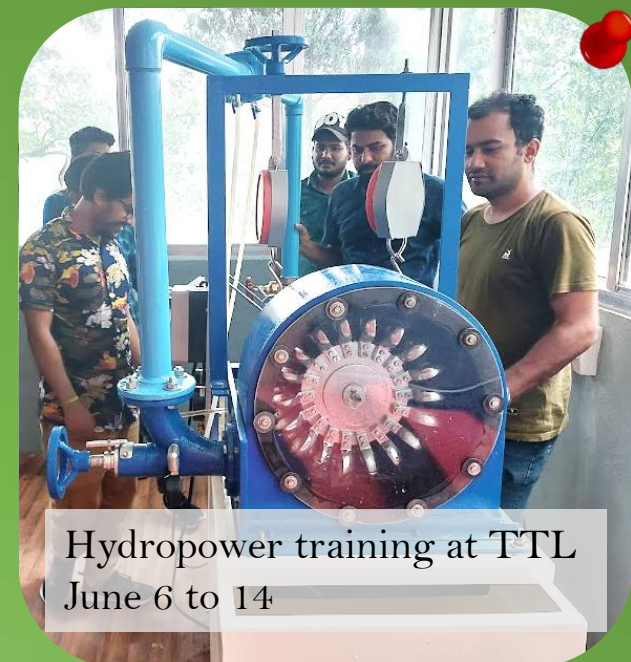
Hydropower training at TTL June 6 to 14