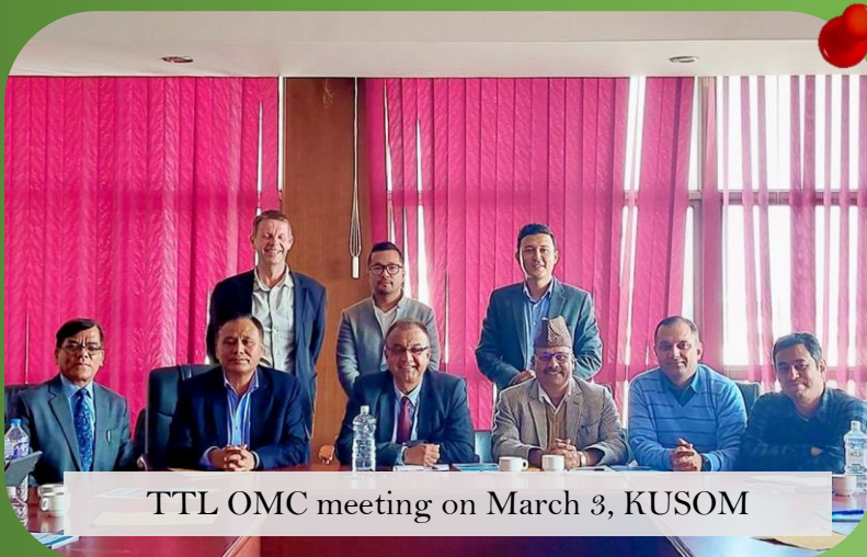
TTL OMC meeting on March 3, KUSOM