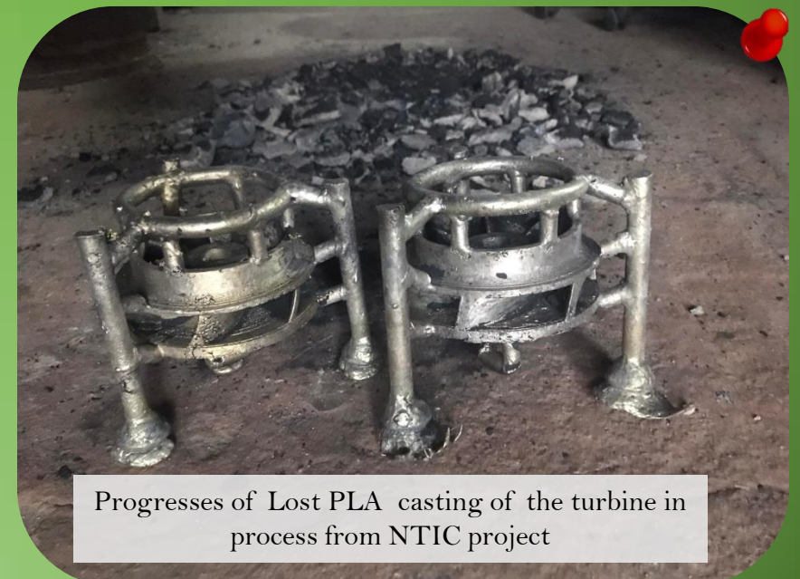
Progresses of Lost PLA casting of the turbine in process from NTIC project