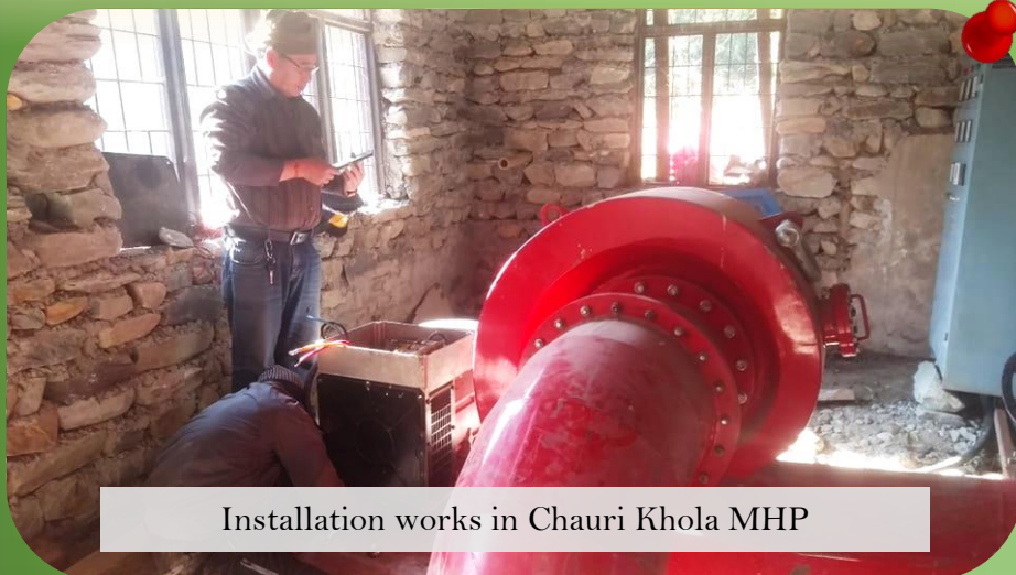
Installation works in Chauri Khola MHP

Installation of ELC/Ballast in Chauri Khola MHP and completion of the initial testing