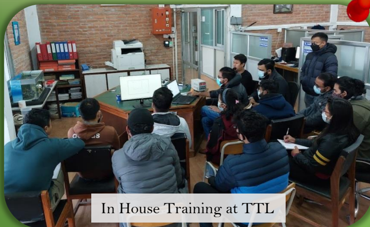
In House Training at TTL

ATHT IV training conducted on December 8 in the topic, 'Digitalization and Flexibility of Hydropower Plants' by Prof. Ole Gunnar Dahlhaug in co-operation with ICH, Norway