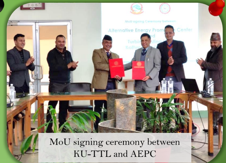
MoU signing ceremony between KU-TTL and AEPC

MoU signed between KU-TTL and AEPC on Dec 27 for upgrading and grid connection of micro-hydro projects in Nepal